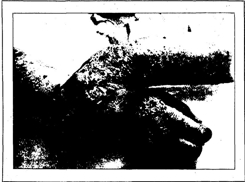
ECZEMA OF HANDS AND FOREARMS.

It is evident that to be successful this treatment must be directed by a scientist who has made a special study of the question. It is useless to suppose that so much sea-water must be diluted with so much pure water to make it "isotonic," and then all that is necessary is to administer it subcutaneously to the patient